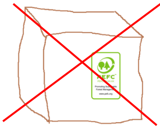
Do not use the promotional label on product