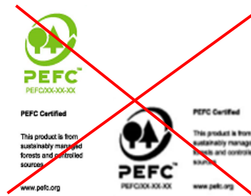
Do not use blurred PEFC label