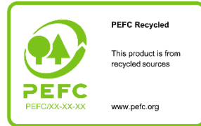
Table 2: Overview of the options of usage of the PEFC on product labels

7.1.2.2.1 The PEFC recycled label shall be used when the product includes only recycled material (see 3.15, definition for recycled material ). The label name is “PEFC Recycled” and the label message: “[This product] is from recycled sources”. The word [this product] may be replaced by the name of the certified product or the certified material included in the product to which the label refers, using the Label Generator.