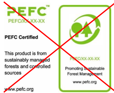
Do not move or remove elements that are not allowed to be removed