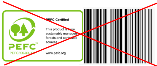
Respect minimum distance between the label and other labels and elements around the label (the "P" of the logo)