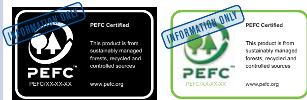
3. White on solid background